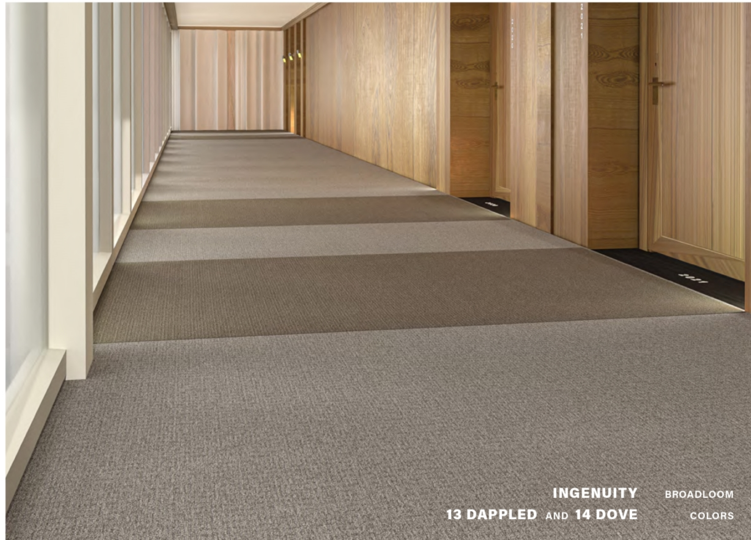
INGENUITY BROADLOOM 13 DAPPLED AND 14 DOVE COLORS