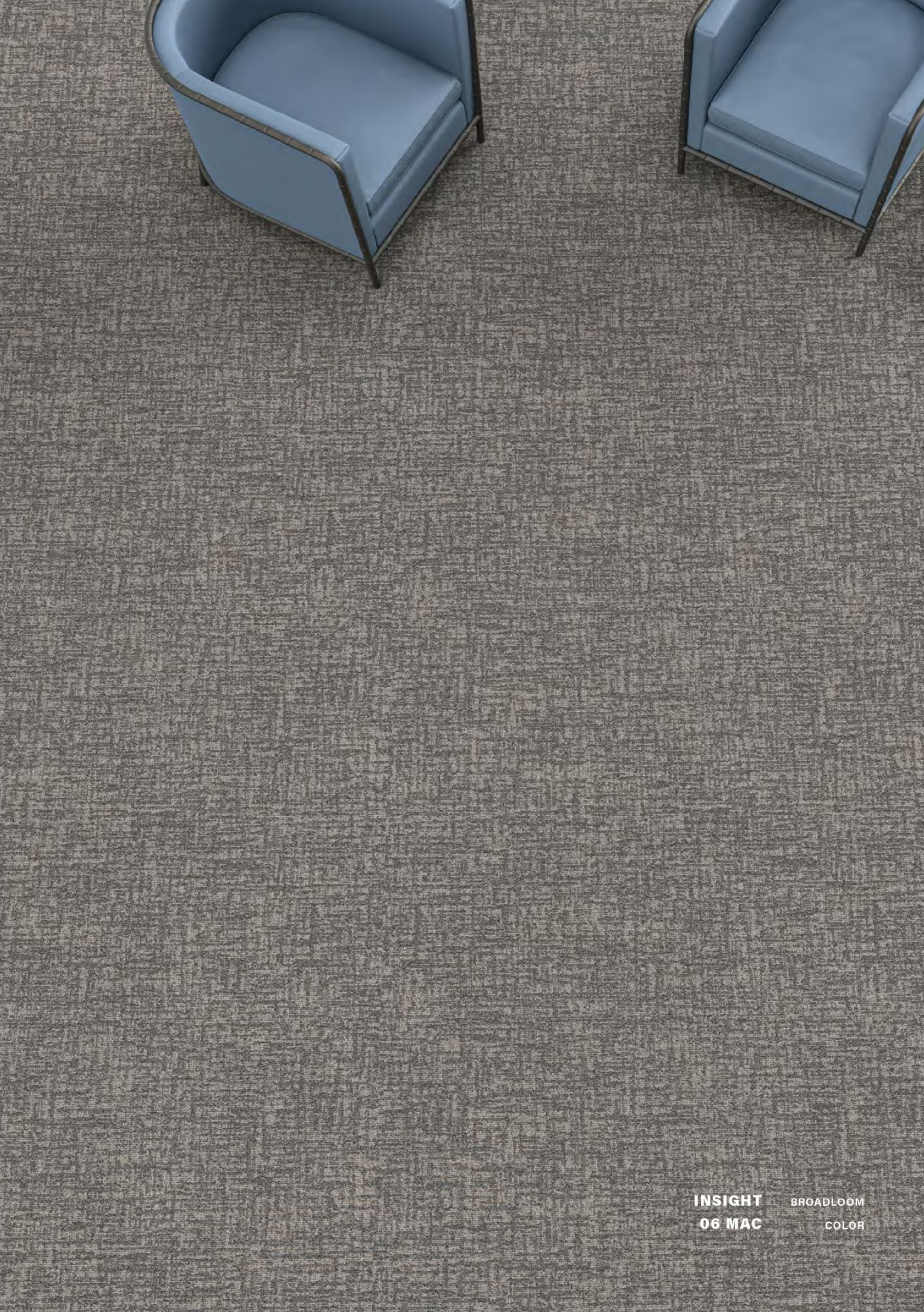
INSIGHT BROADLOOM 06 MAC COLOR