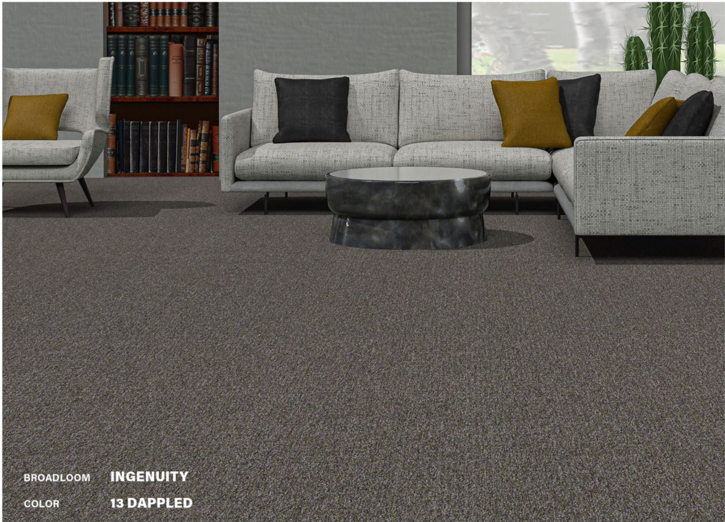
BROADLOOM INGENUITY COLOR 13 DAPPLED