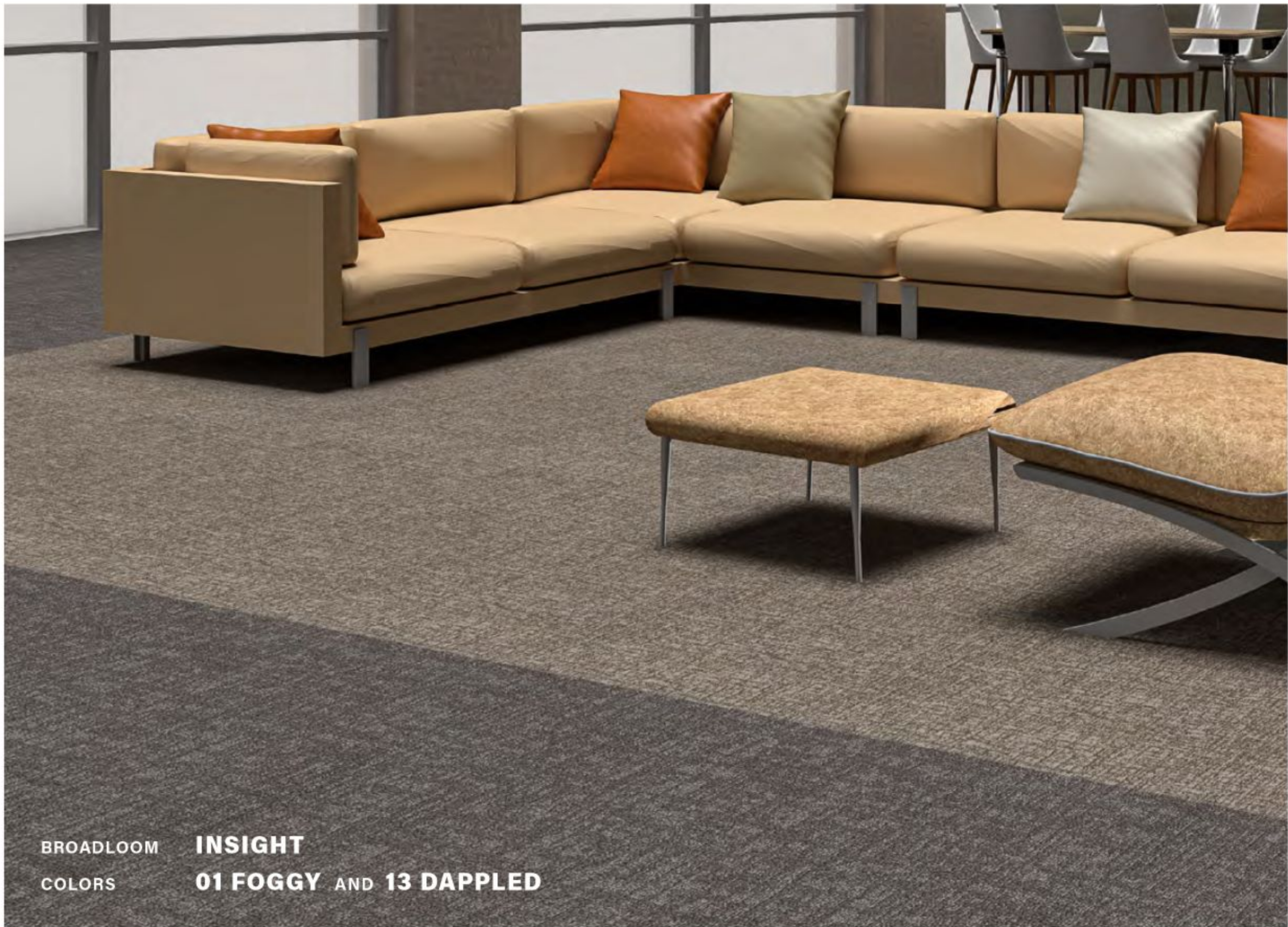
BROADLOOM INSIGHT COLORS 01 FOGGY AND 13 DAPPLED