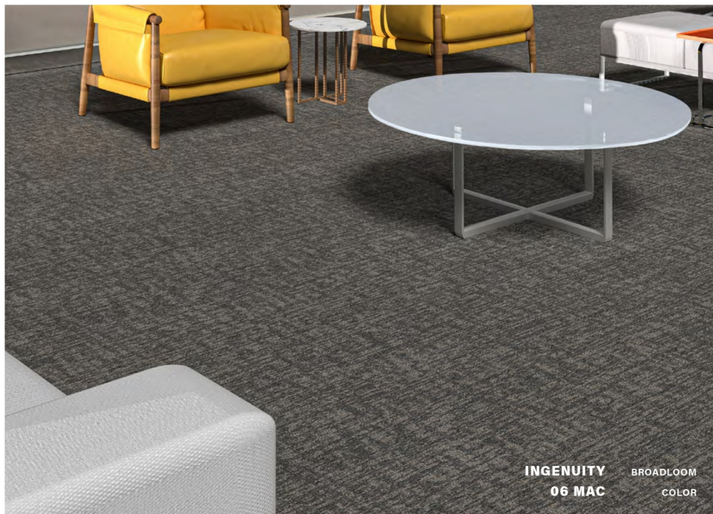
INGENUITY BROADLOOM 06 MAC COLOR