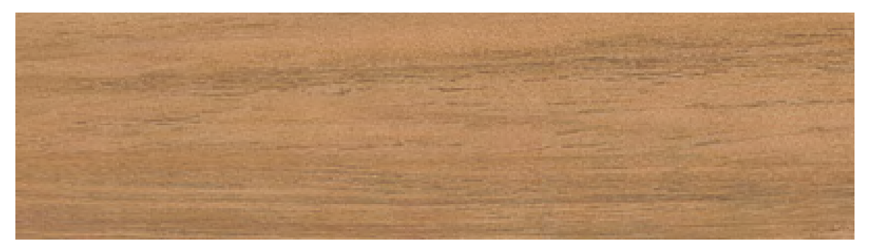
WS05 Tiger's Eye