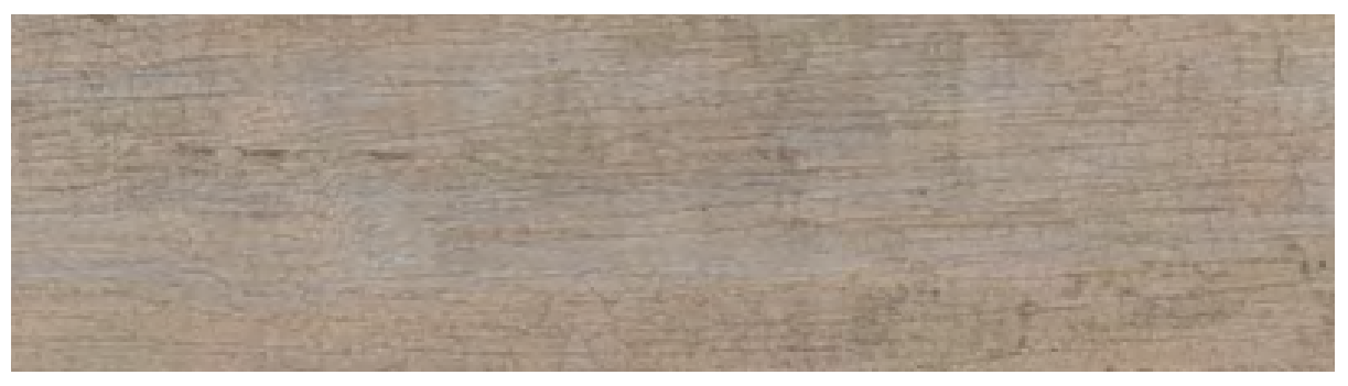
DC01 Light Toast