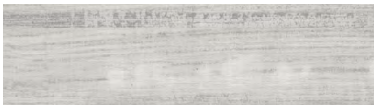
AB03 Silver Lining