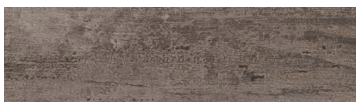
DC04 Grounded Taupe