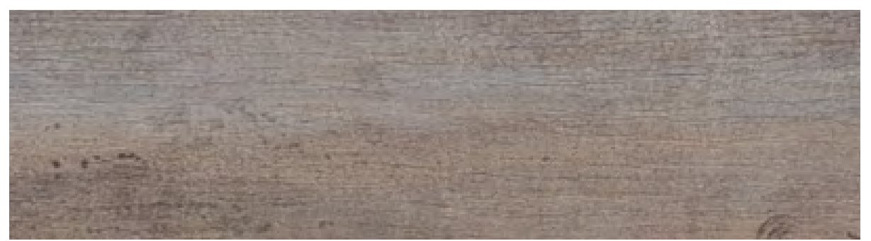
DC03 Cool Mist