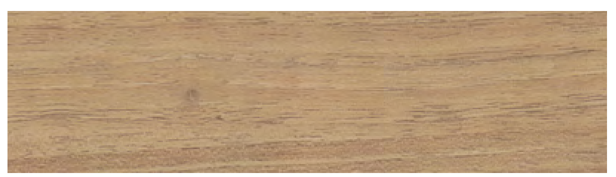
WS04 Hey Honey