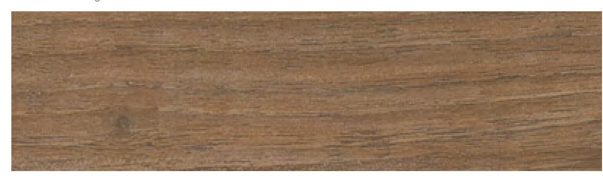
WS03 It's Nuts!