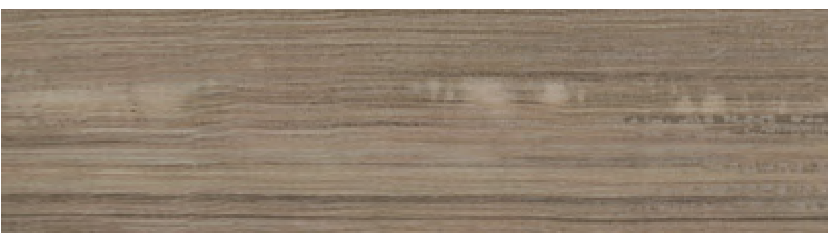
AB01 Sandy Beach