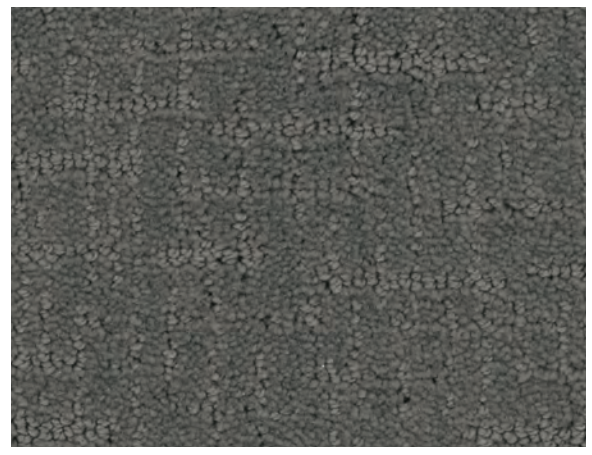
31403 CHANNEL SURFING