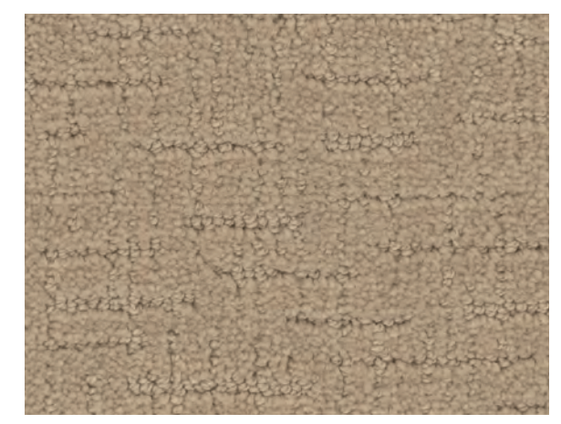
31407 SCENTED OILS