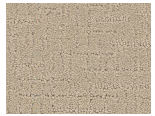
31405 EASY LISTENING