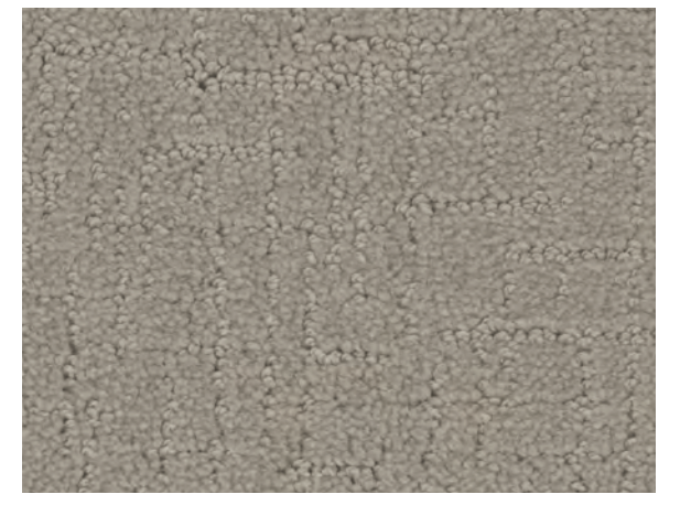
31401 GOOD BOOK