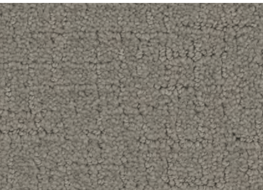
31404 MOVIE NIGHT