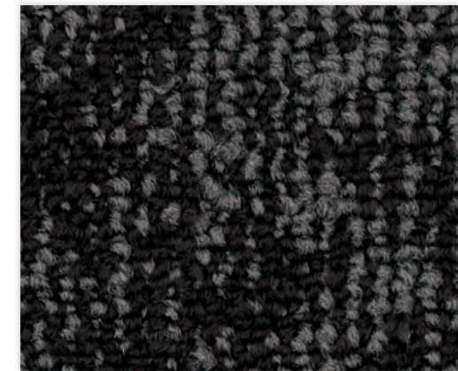
06 AFTER MIDNIGHT