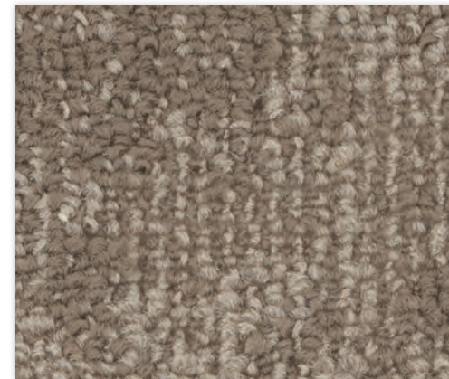
05 OVERCAST DAYS