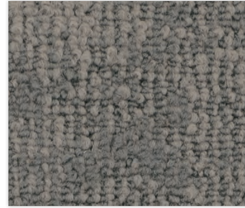
01 LOOKS LIKE RAIN